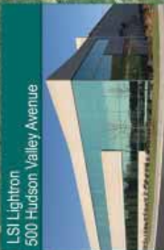
LSI Lighttron 500 Hudson Valley Avenue