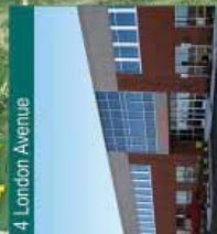
4 London Avenue