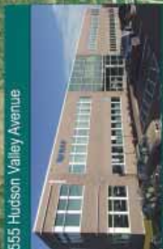
555 Hudson Valley Avenue