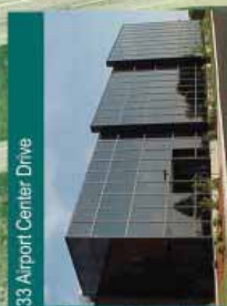
33 Airport Center Drive