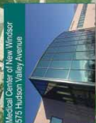
Medical Center of New Windsor 575 Hudson Valley Avenue